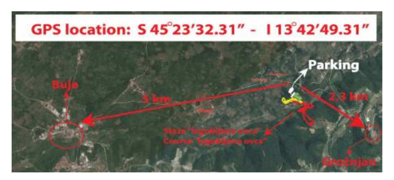
For any further questions please contact us using our contact information.

The race will be held on the location of Buje-Grožnjan road. Turn from the asphalt road after you pass the village of Bankovci. The arrival to the parking lot of the race location will be visibly marked with arrows and MTB boards on both sides.